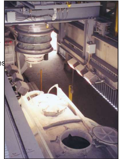
Articulating arm positioning system.

Fully automatic, unattended loading is accomplished by using the SmartLoader Vision System. The development of this system represents the final link to truly automatic loading. The top of the truck is scanned as the truck enters the station. As the open hatch is detected, a traffic light signals the driver to stop. The vision system then takes the final hatch coordinates and adjusts the loading spout positioner centering the spout to the hatch. The spout is then lowered into the hatch once the scale has captured the vehicle tare weight. When the filling cycle is complete, the spout raises. The traffic signal and exit gate then allow the driver to exit the station.