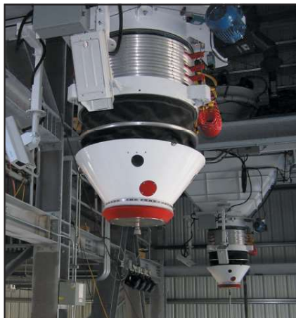
Dual direction positioning system.

The Smart Loader Vision technology requires that the loading station be enclosed with no possibility of sunlight illuminating the vehicle either by direct sunlight or reflected sunlight. Past system performance has shown that the Vision system is capable of identifying 98 percent of hatches found on common bulk hauling trucks. Some error can be attributed to the driver's inability to understand the system operation. The user is responsible for notifying truck drivers of the new system operation, written driver instruction or instructional signs outside of the loading station. The system controls and operation scheme must accommodate manual intervention on occasion due to driver error or system malfunction. The manual operating scheme can include driver or plant personnel intervention.